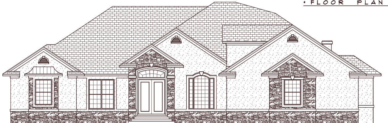
* FRONT ELEVATION *