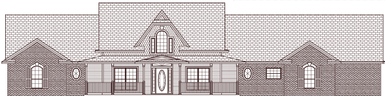
* FRONT ELEVATION *