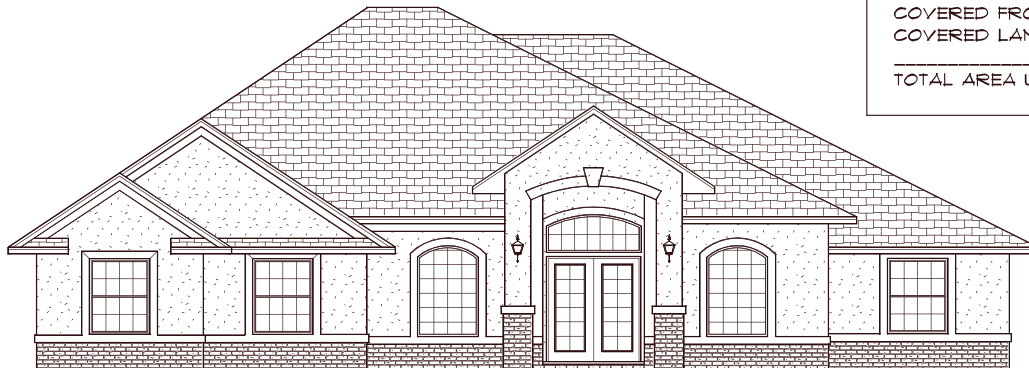
* FRONT ELEVATION *