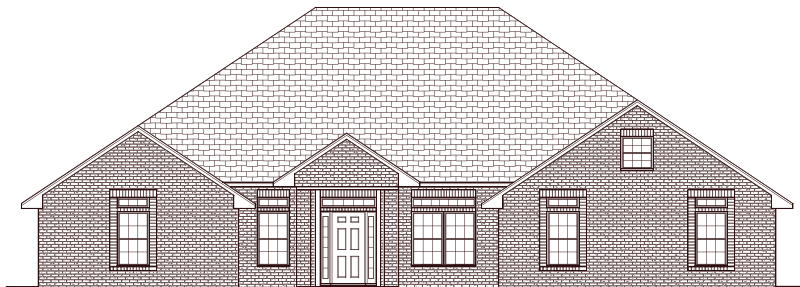
* FRONT ELEVATION *