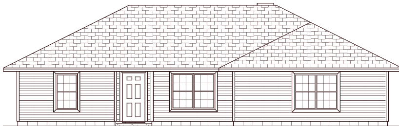
* FRONT ELEVATION *