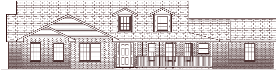
* FRONT ELEVATION *