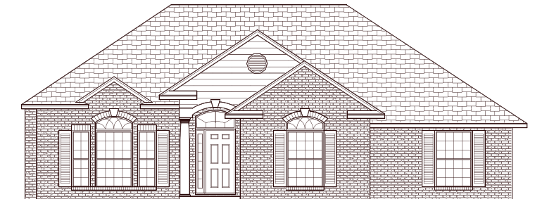
* FRONT ELEVATION *