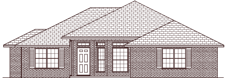
* FRONT ELEVATION *