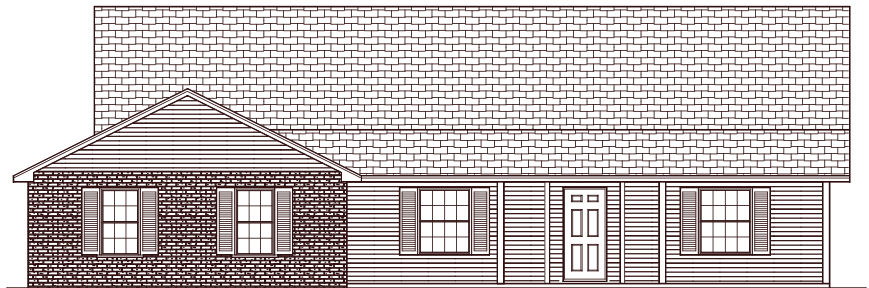
* FRONT ELEVATION *